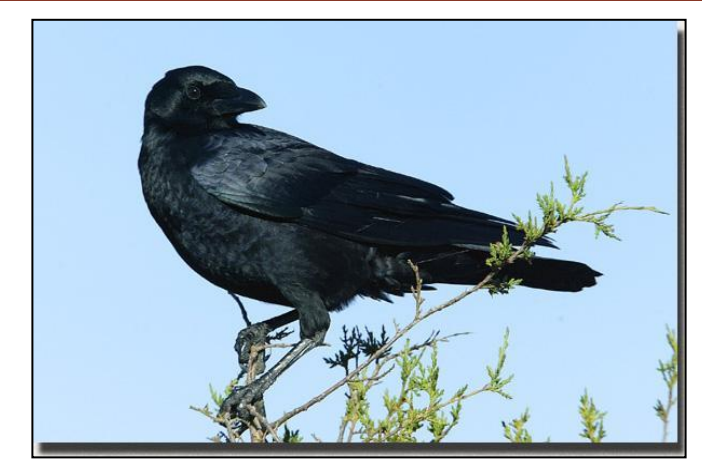
Even American crows and their active nests are protected under the MBTA.

Under the MBTA, it is illegal to kill, capture, or posses any of the listed adult birds, their eggs, young, or active nests without a permit. An active nest contains young (nestlings or fledglings) or eggs. Federal and state permits to move active nests can sometimes be obtained in extreme situations. Contact a qualified biologist for help getting a permit.