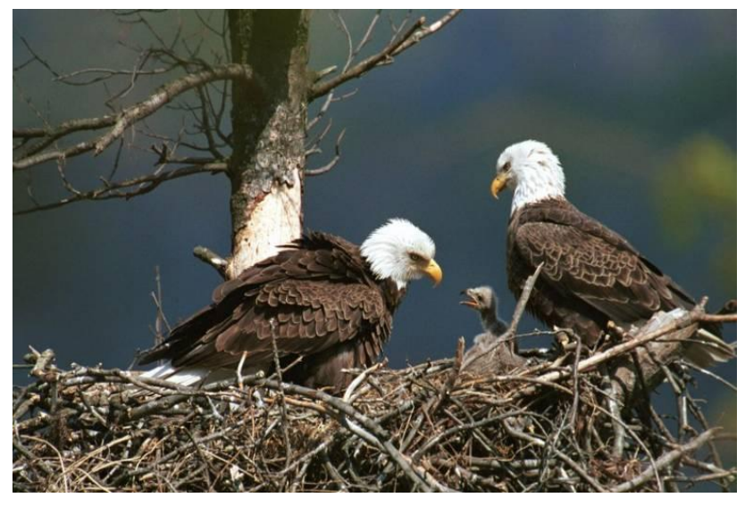
An active bald eagle nest. Do not start work around a large platform nest without contacting a biologist.

The BGEPA carries a fine up to $100,000 and a year in prison. (Criminal Fines Improvement Act P.L. 100-185; 1987)